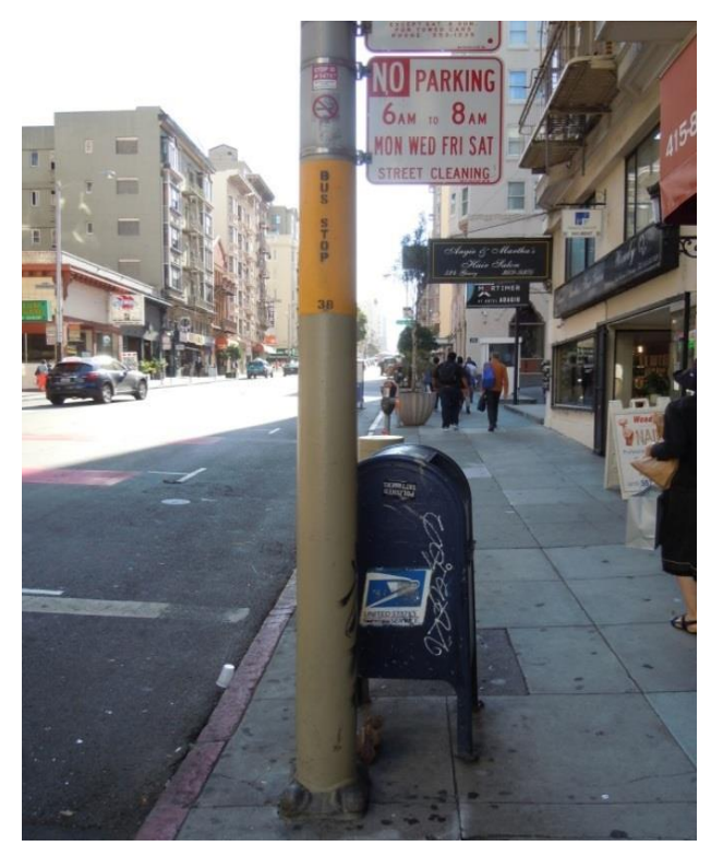
Figure 1-8 Bus Loading Areas

Some stop locations throughout the corridor, like this location in the Tenderloin, feature only a bus stop pole, with no shelter, map, or other amenities.