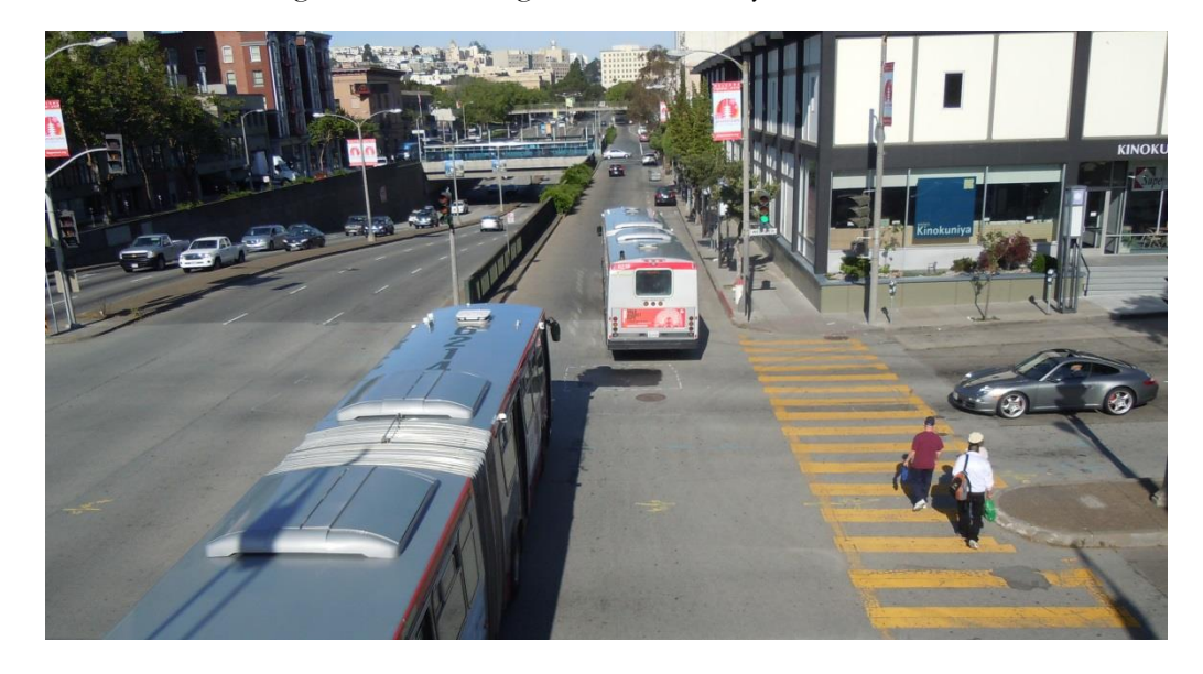
Figure 1-5 Bus Delays and Crowding

Lack of reliability in Geary bus travel times leads to bus bunching, in which buses have been so delayed that they arrive together at a bus stop, such as this one in the Japantown area, instead of at even time intervals, contributing to bus crowding and further delays.