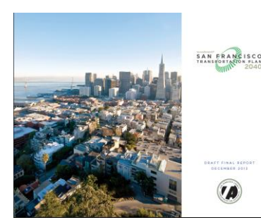
The San Francisco Transportation Plan (2040) includes the Geary corridor in the SFTP Investment Vision.

The CWTP evaluated alternative approaches to meeting the City's rapid transit system needs and recommended a preferred scenario that called for development of a citywide BRT network. Figure 1-2 shows the CWTP's identified rapid transit network. The Proposition K Expenditure Plan, the investment component of the 2004 CWTP approved by voters reauthorizing the City/County's half-cent transportation sales tax measure, featured Geary BRT as one of the named projects to be funded.