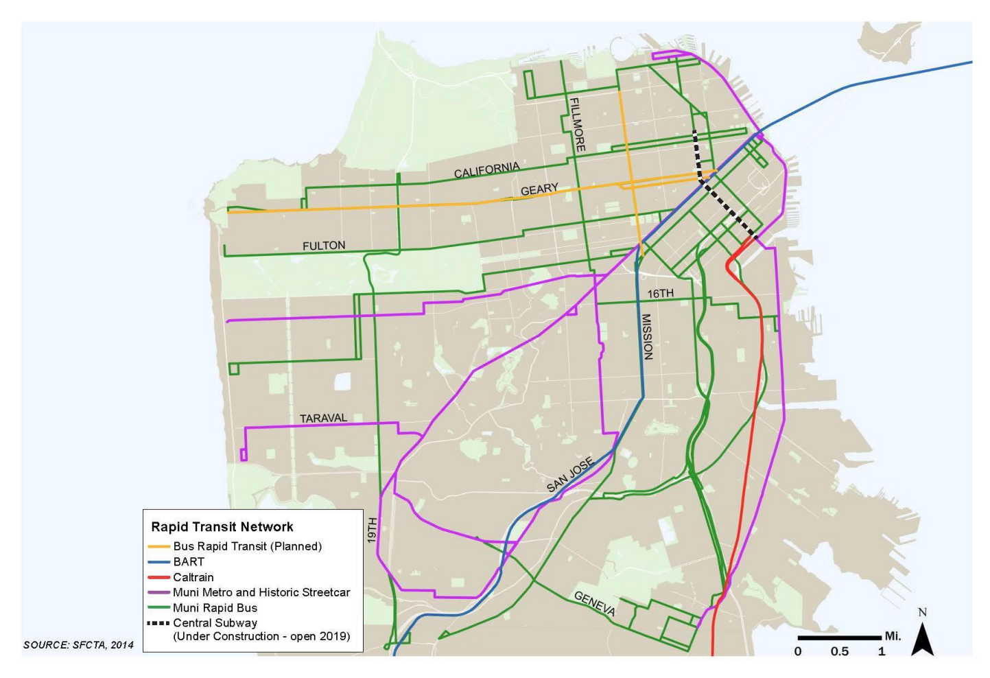
Figure 1-2 San Francisco Rapid Transit Network Map

In 2013, SFCTA adopted a new version of the long-range, countywide transportation plan, called the San Francisco Transportation Plan (SFTP). It identified four core goal areas, including Livability , Economic Competitiveness , World Class Infrastructure , and Healthy Environment , and reaffirming the importance of the Geary corridor in meeting them by including it in the SFTP Investment Vision.