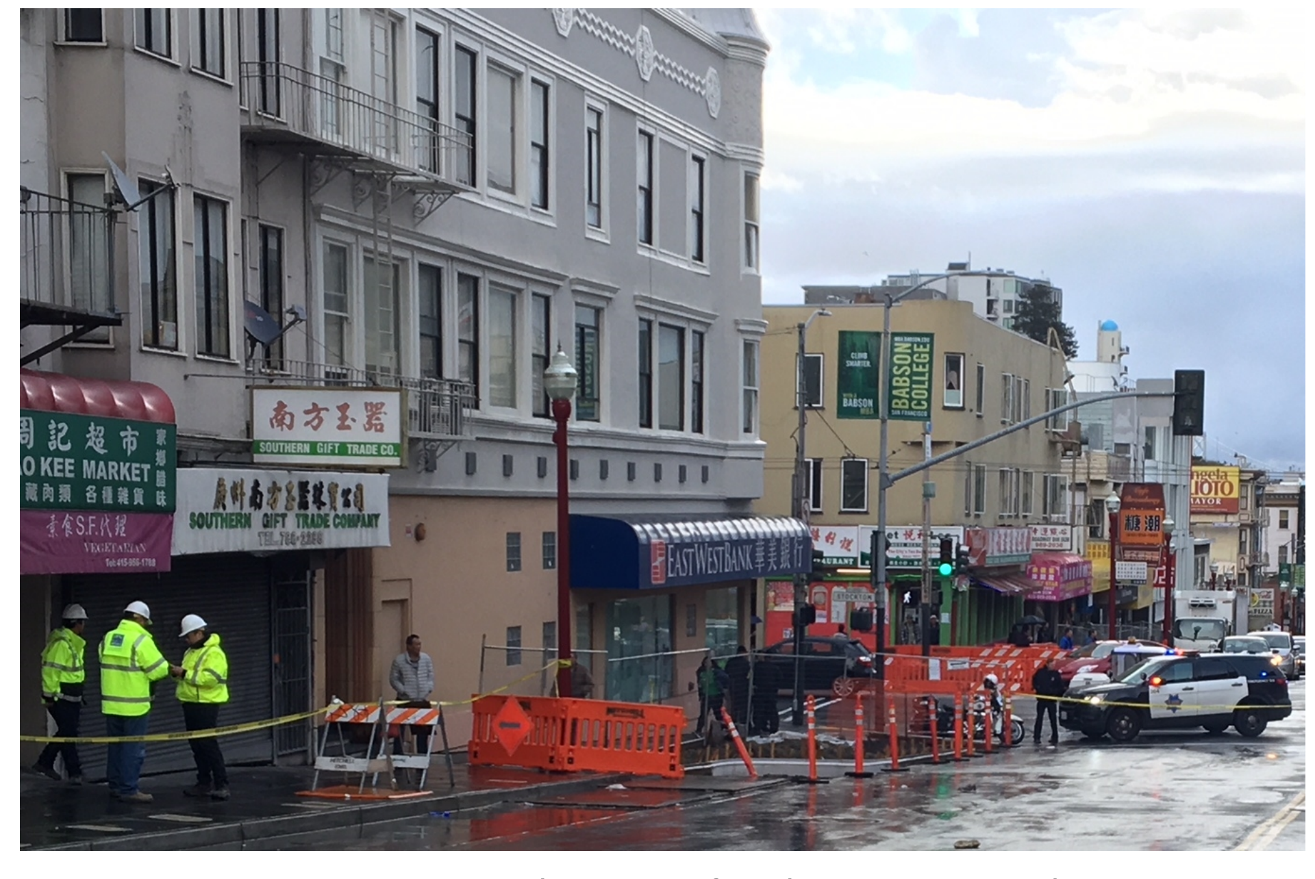
Broadway west of Stockton Street – March 16, 2018