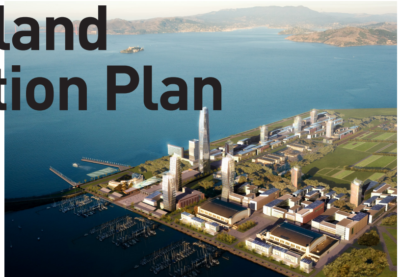
Rendering of the proposed redevelopment project on Treasure Island.

Extensive open space, along with hotels, restaurants, shops, and entertainment venues will make the neighborhood an appealing place to live and work. This new development will result in tens of thousands of additional trips to and from the island each day, primarily using the San Francisco-Oakland Bay Bridge.