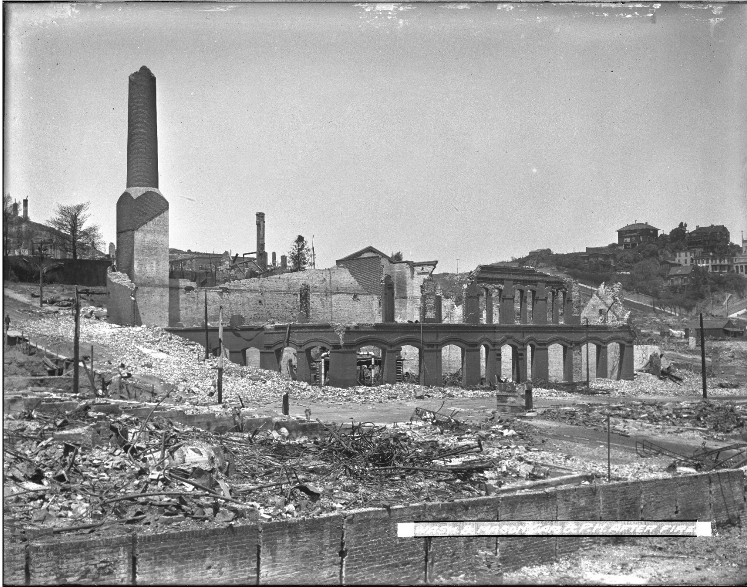
After the 1906 earthquake