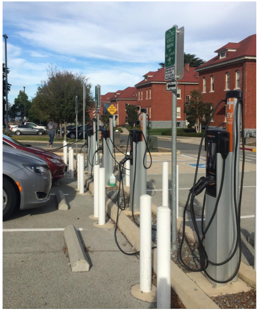
Example Level 2 EV Chargers

reimbursement on Project Open Hand providing evidence of procuring a corresponding EV for each charger to ensure TFCA project will result in air quality benefits