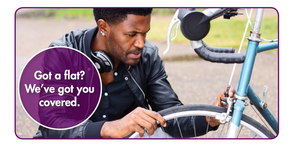
Get a FREE ride home from work with San Francisco's Emergency Ride Home program. Visit SFEnvironment.org/ERH