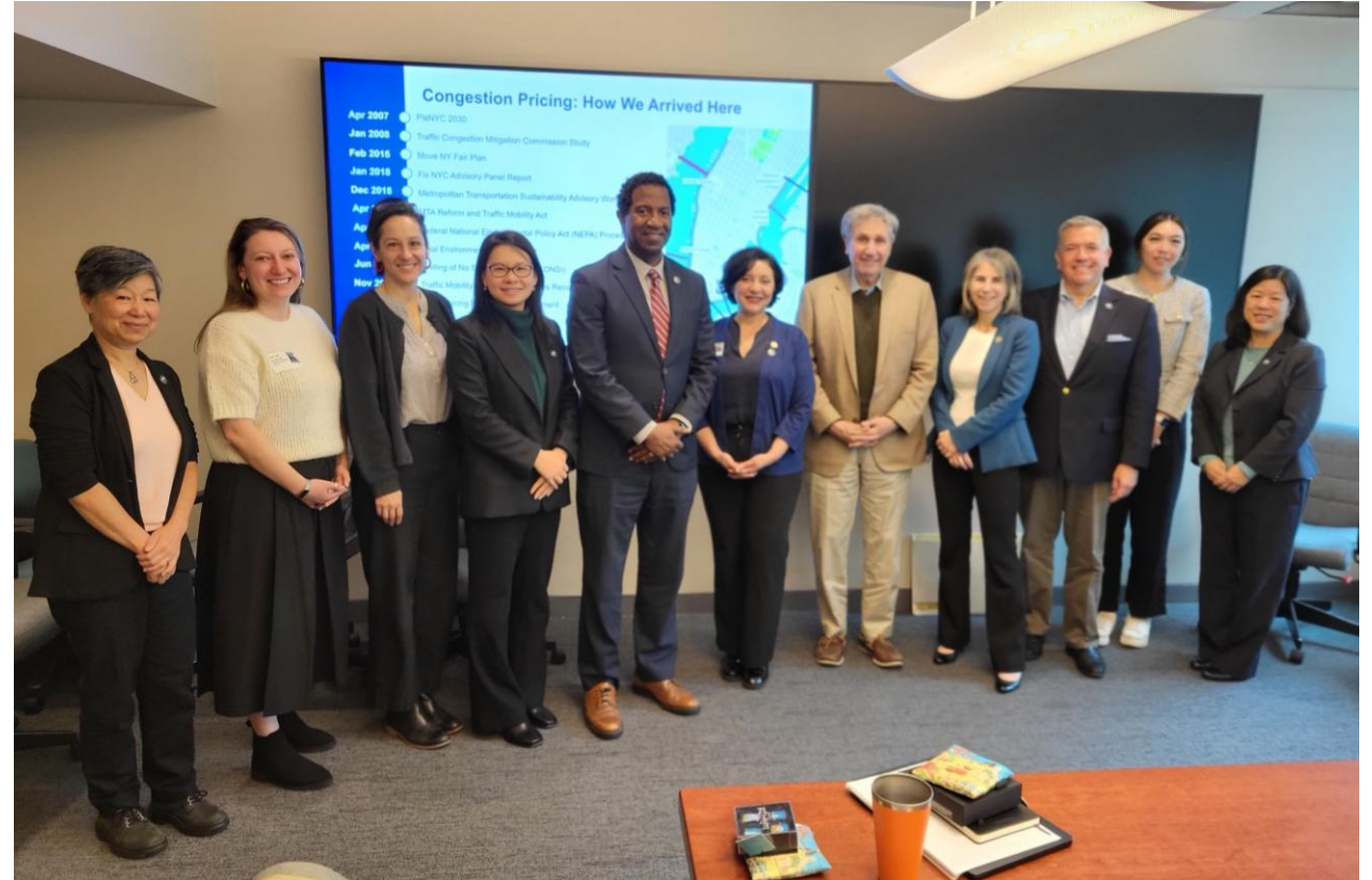
NY MTA officials with SFCTA delegation