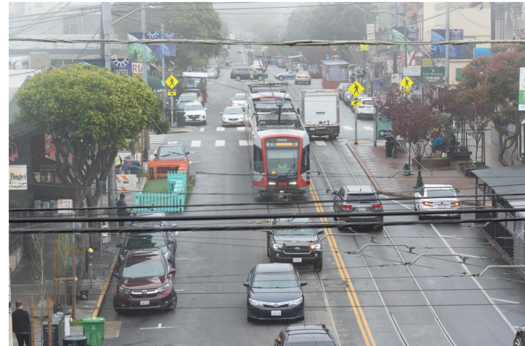
9 th St and Irving St