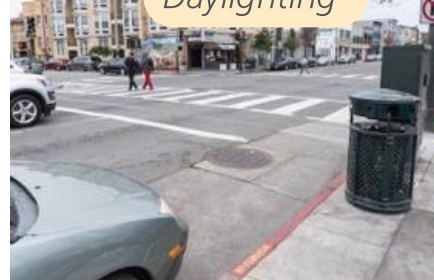
Longer walk time