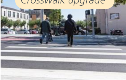
Pedestrian head start