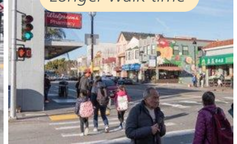
Longer walk time