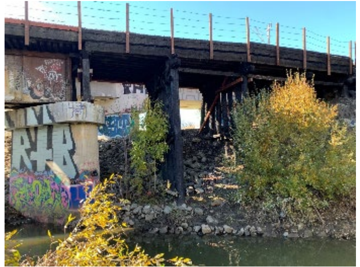
Existing wooden piles and sub-structure