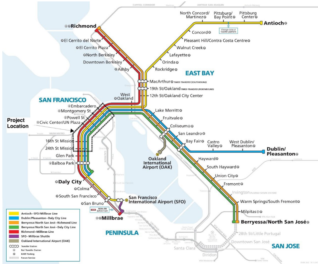
Figure 2. BART System Map and Project Location