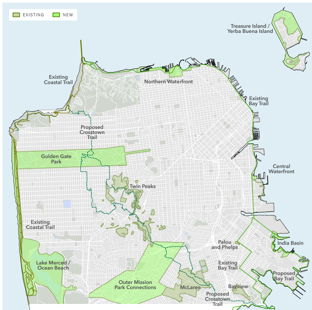
Figure 2. Priority Conservation Areas in San Francisco.