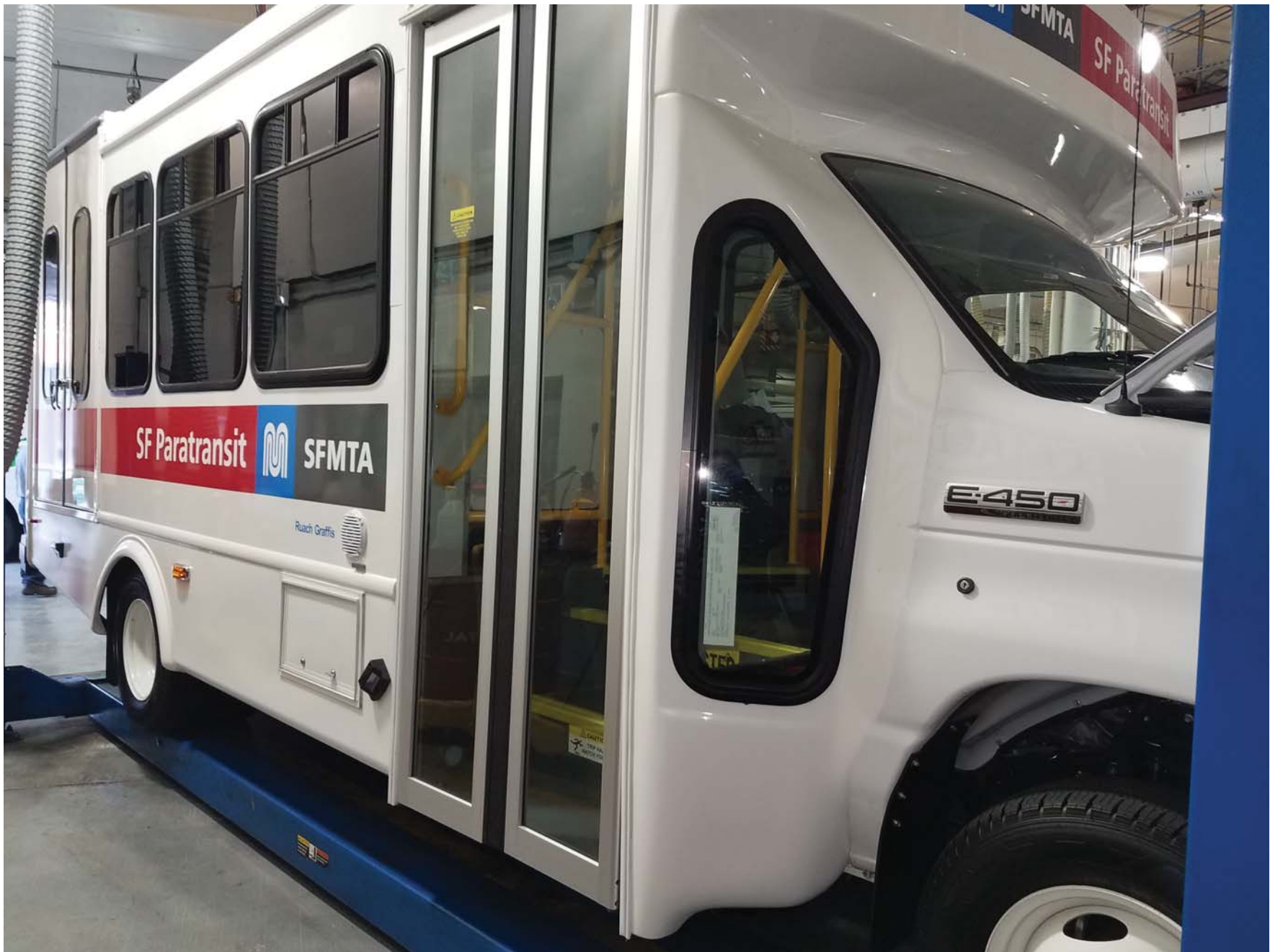
E-450 Transit Van (Cutaway)