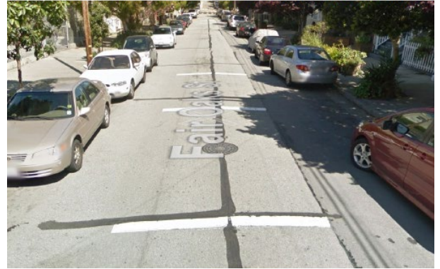
Replacement speed “hump” on Fair Oaks St