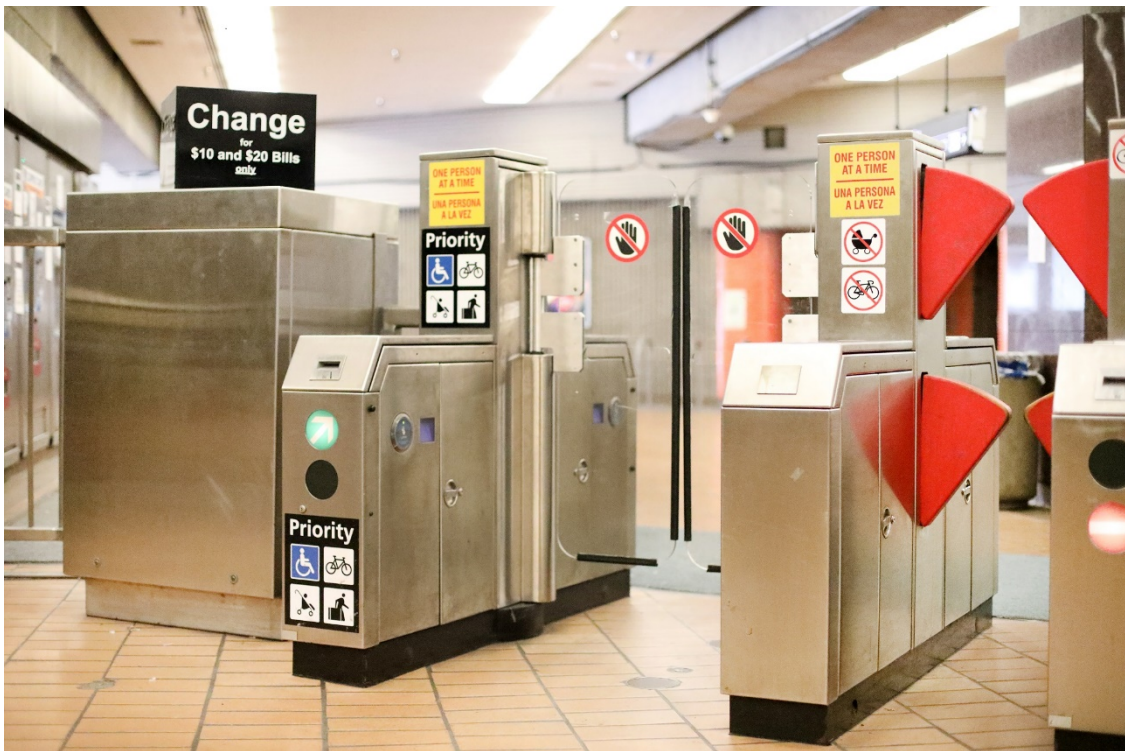
New AFG Installed at BART's Richmond Station