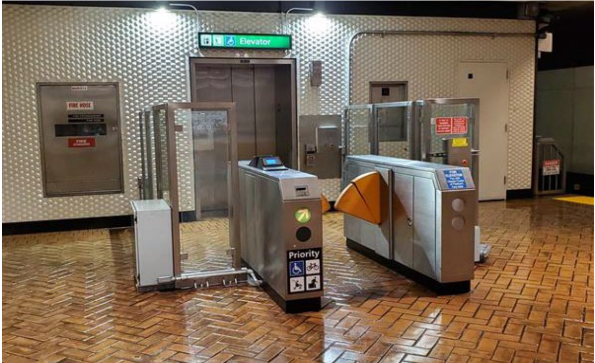
Current AFG located at Montgomery Station, ID M20, Elevator Platform

The design of current and new AFGs is shown below. The new AFGs will provide customers additional space and time to tag their Clipper card and pass through. This new technology will improve accessibility and connectivity for people who live, work and/or visit San Francisco.