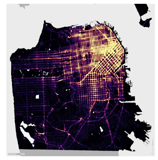
DAILY TNC TRIP HOTSPOTS, TNCs Today