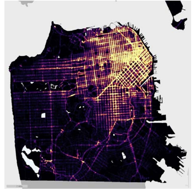
DAILY TNC TRIP HOTSPOTS