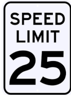
Speed Limit Setting