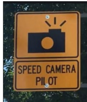
Automated Speed Enforcement