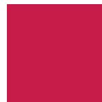
Rapid Ruby Pantone 7636 C #c41d4a