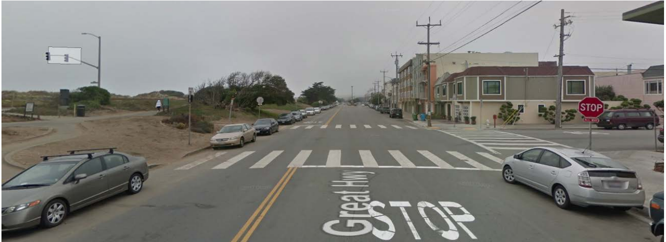
Existing conditions: Lawton Street