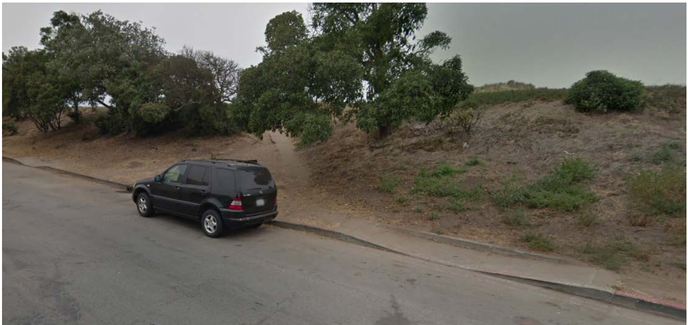
Existing conditions: Irving Street