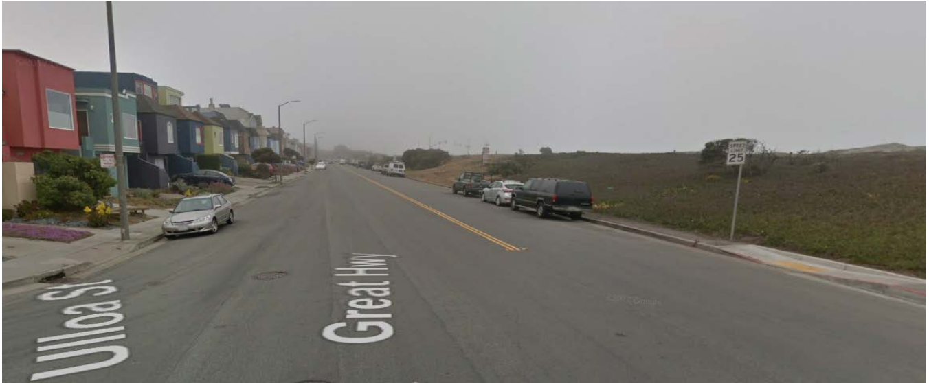
Existing conditions: Ulloa Street