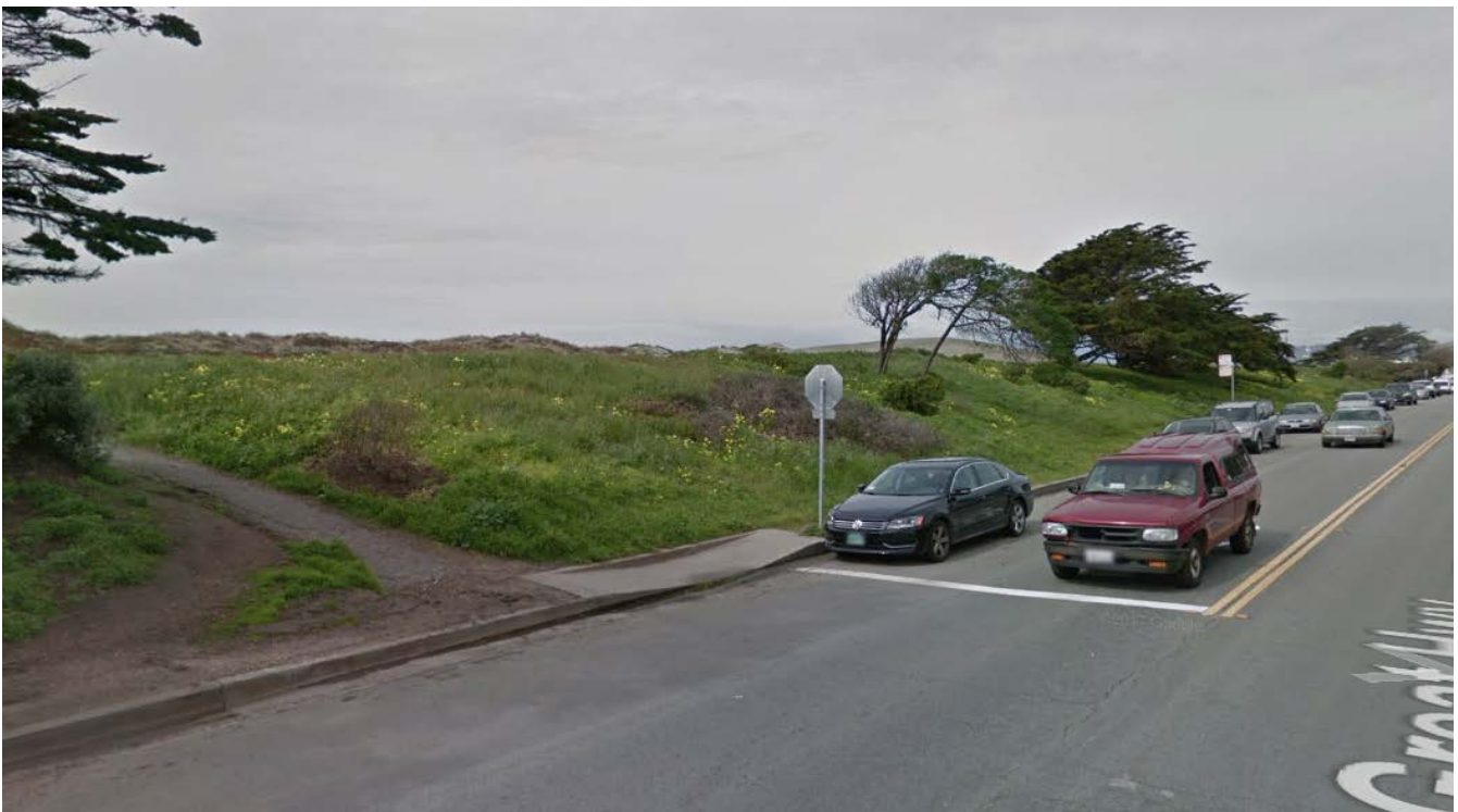
Existing conditions: Kirkham Street