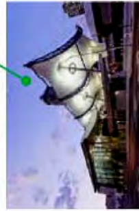
Intermodal entry station with examples of housing blocks and slender infill designs.

BRT FUTURE LINES + CONNECTIVITY TO REGIONAL TRANSIT Aaron Goodman 11.29.11 – Memo Submitted via email with this attached image and link.