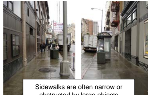
Sidewalks are often narrow or obstructed by large objects