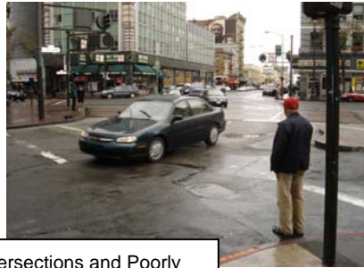
Awkward Intersections and Poorly Marked Crosswalks Contribute to the sense that cars dominate the neighborhood