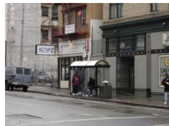
Muni shelters don't provide much space for waiting passengers