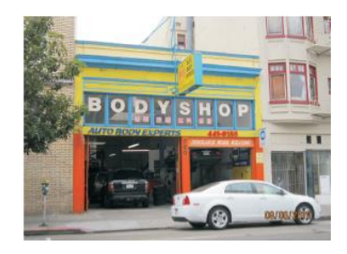
Land use types - Auto Body Experts 720 O'Farrell Street