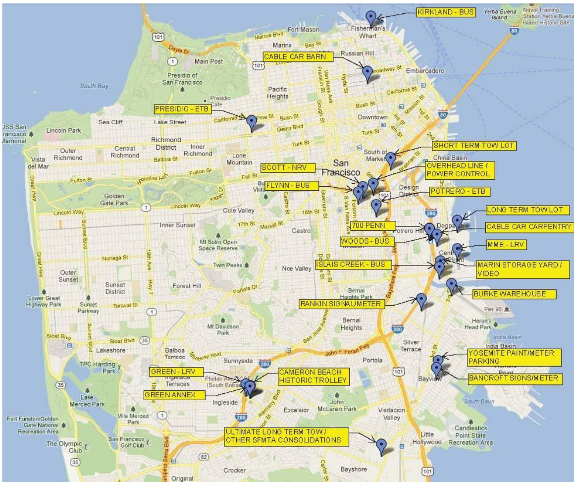
FIGURE 4 – MAP OF FACILITIES LOCATIONS