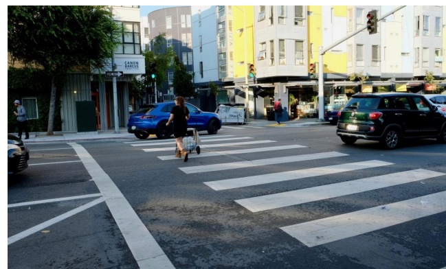
Mid-block crossing 8th and Natoma