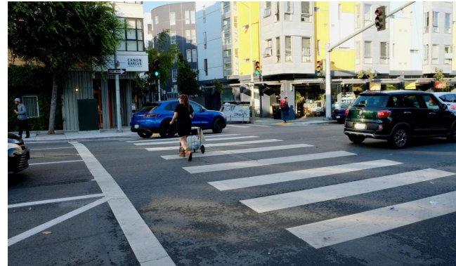
Mid-block crossing 8th and Natoma