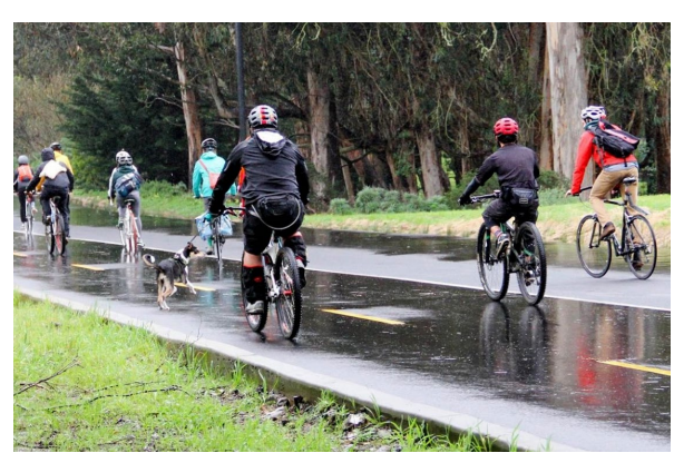
Bike and pedestrian path on Mansell St, McLaren Park