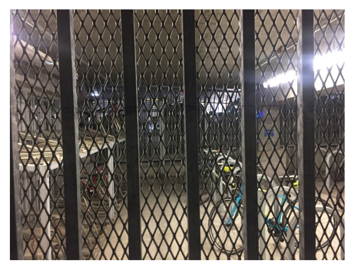
Figure 2: Example of fencing material