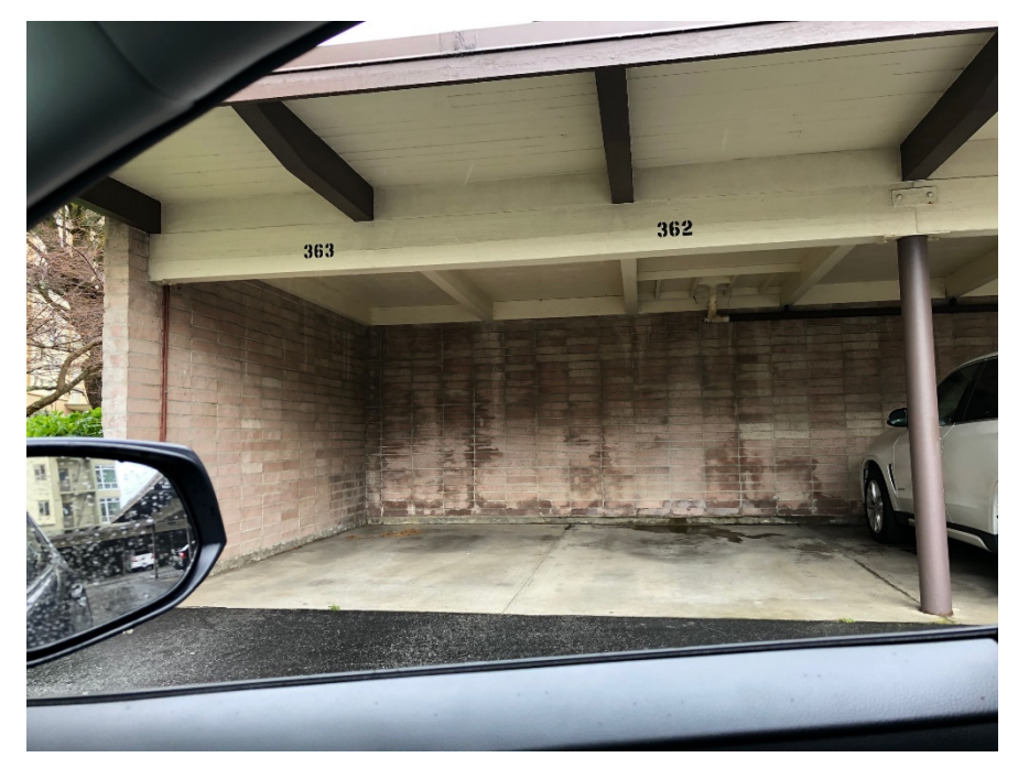
Figure 1: Current conditions

This bicycle storage facility will provide secure, convenient bicycle storage that serves University Park North, the residential community to the north of San Francisco State University's main campus. It will consist of a fenced-in cage built into 4 existing car ports, a gate accessed by keys, and standard bicycle racks that will store 40 bikes.