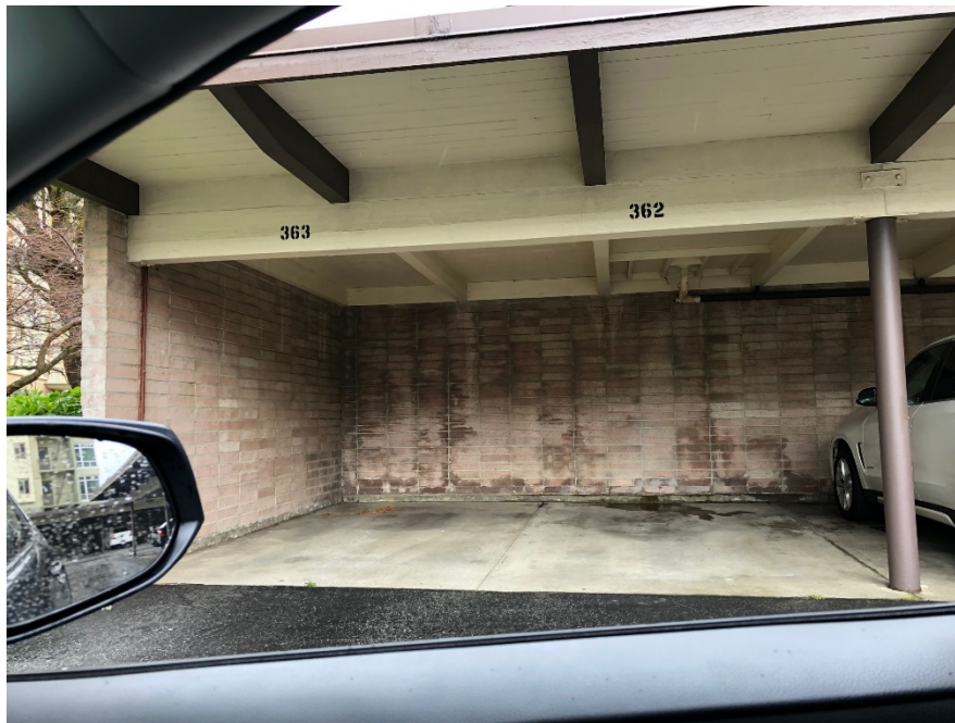
Figure 1: Current conditions

This bicycle storage facility will provide secure, convenient bicycle storage that serves University Park North, the residential community to the north of San Francisco State University's main campus. It will consist of a fenced-in cage built into 4 existing car ports, a gate accessed by keys, and standard bicycle racks that will store 40 bikes.